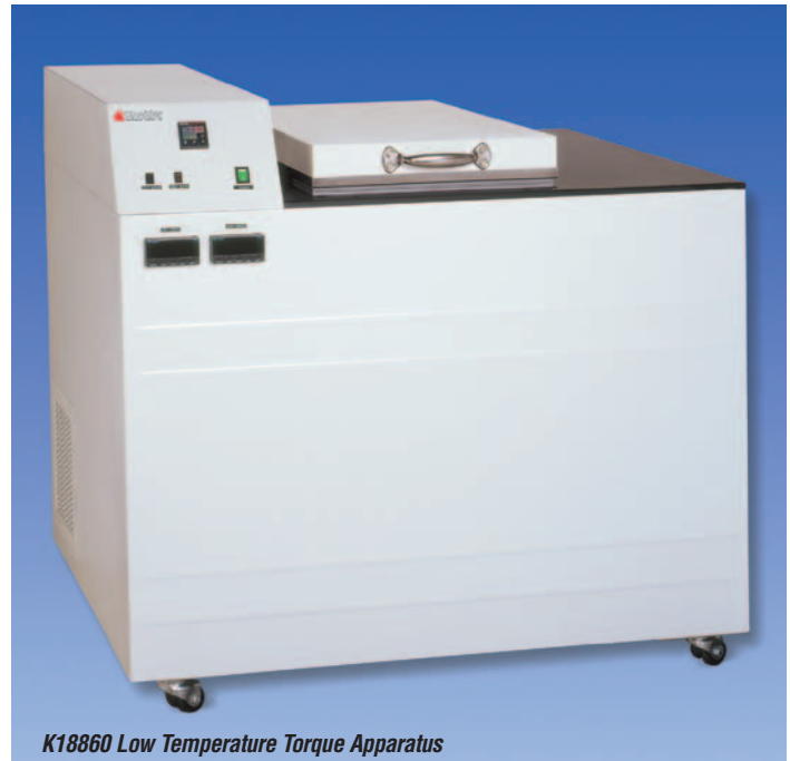
K18860 Low Temperature Torque Apparatus

Cabinet: floor-mount, polished stainless steel exterior, rides on swivel casters