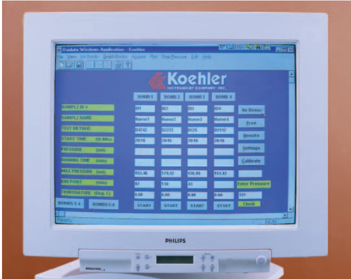
Oxidata™ Pressure Measurement System