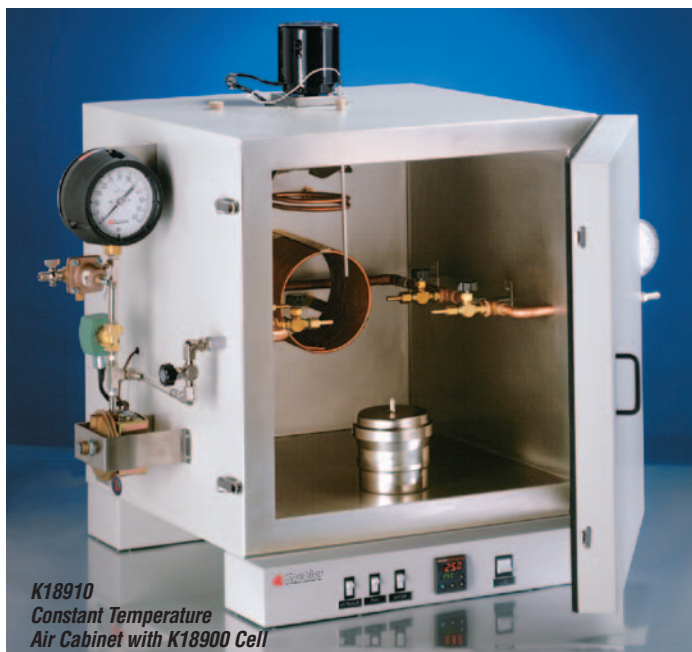
K18910 Constant Temperature Air Cabinet with K18900 Cell