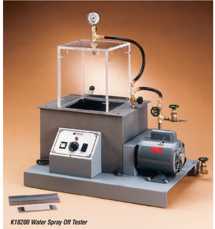
K18200 Water Spray Off Tester

Complete Water Spray Apparatus meeting ASTM specifications, including spray chamber, delivery system and constant temperature reservoir. Sprays water at the specified rate and temperature on a test panel coated with sample grease. To test for water spray resistance, fill reservoir with 8L of tap water and set thermostat at test temperature. Circulate the water through the system to attain temperature equilibrium and insert the coated test panel in the spray chamber. Adjust water spray to 40psi (276kPa) and continue for 5 minutes. Water spray system includes ½hp positive displacement pump; spray nozzle with snubber fitting; 0-60psi pressure gauge; bypass valve; shut-off and drain valves; and flexible high pressure water lines. Hinged acrylic spray chamber cover is recessed into the chamber housing to insure watertight operation. Two thermometer wells permit separate monitoring of reservoir and water spray temperatures. Standardized grease application fixture coats test panel with the required thickness of sample grease. Uses tap water; does not require water hook-up.