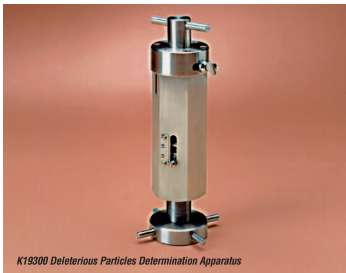
K19300 Deleterious Particles Determination Apparatus

For NIST traceable certified thermometers, please refer to the ASTM Thermometer section on pages 184 through 191.