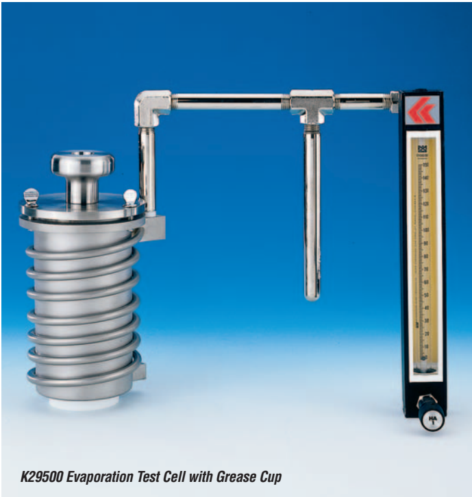
K29500 Evaporation Test Cell with Grease Cup