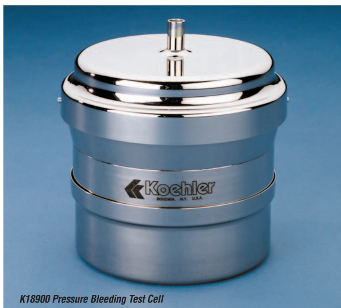
K18900 Pressure Bleeding Test Cell

For NIST traceable certified thermometers, please refer to the ASTM Thermometer section on pages 184 through 191.