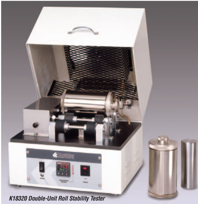
K18320 Double-Unit Roll Stability Tester