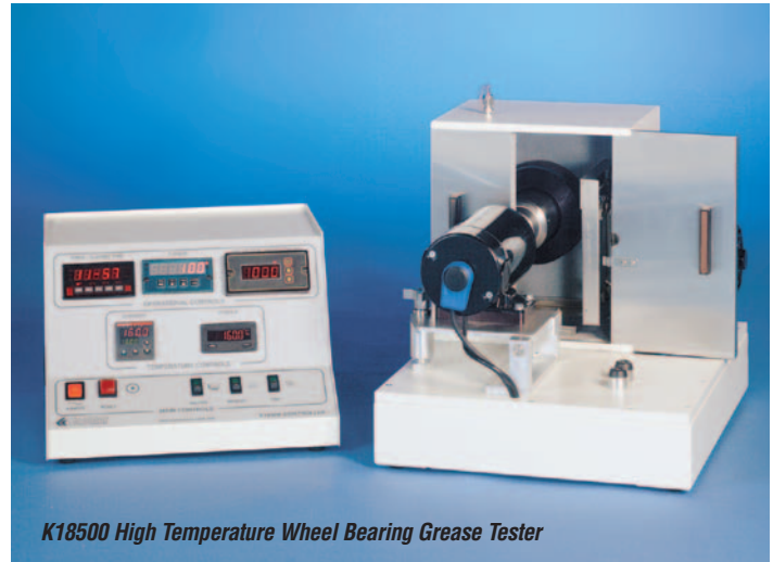
K18500 High Temperature Wheel Bearing Grease Tester

Performs life performance and accelerated leakage tendencies tests on lubricating greases in accordance with ASTM test specifications. Consists of a modified front wheel hub-spindle-bearings assembly housed in a constant temperature oven and coupled to a ½hp variable-speed drive motor. Controls test functions automatically and provides continuous digital display of motor torque, rpm, chamber temperature, spindle temperature, time cycle and elapsed time. Test parameters outside of ASTM specifications can be selected by the operator for in-house testing. Automatically terminates test and displays elapsed on-cycle hours when grease deterioration causes drive motor torque to increase to the calibrated end point. A built-in thirty second time delay circuit prevents erroneous test terminations due to momentary surges in motor torque at the beginning of the on-cycle. Insulated constant temperature oven is equipped with a 1200W heater and balanced ½ hp circulation fan for efficient heat distribution. Sliding access doors and a movable platform that swings the drive motor out of the way provide easy access to the spindle assembly. Modified steel spindle and hub assembly conforms to all critical 1971 Chevy II dimensions and is fitted with thermocouple, bearing thrust loading device and anodized aluminum grease collector. All controls and monitors are housed in a separate cabinet.