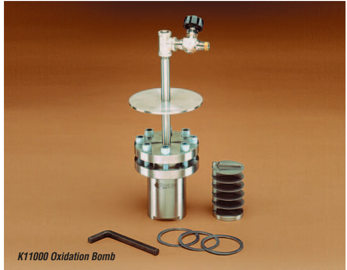
K11000 Oxidation Bomb

*This ordering information is for installation to Koehler grease oxidation test equipment. For other makes of equipment, a few items of basic hardware may also be required—please contact your Koehler representative for assistance.