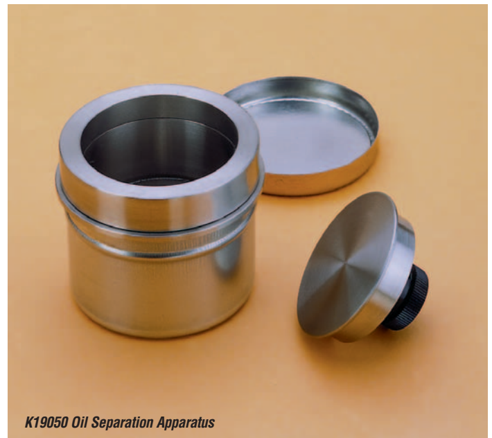
K19050 Oil Separation Apparatus