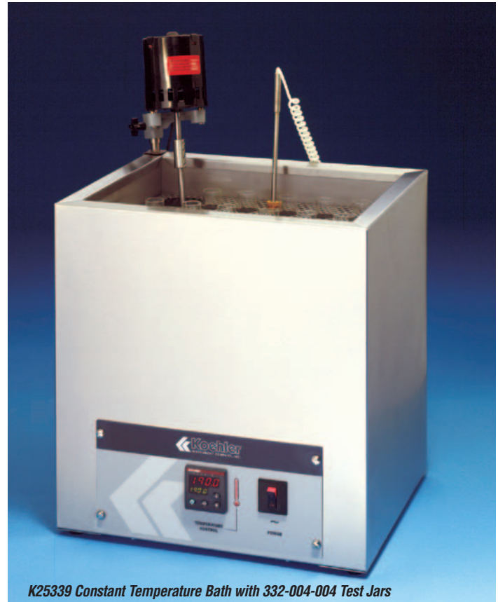
K25339 Constant Temperature Bath with 332-004-004 Test Jars

For NIST traceable certified thermometers, please refer to the ASTM Thermometer section on pages 184 through 191.