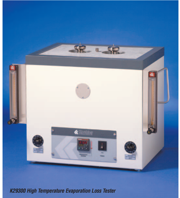
K29300 High Temperature Evaporation Loss Tester