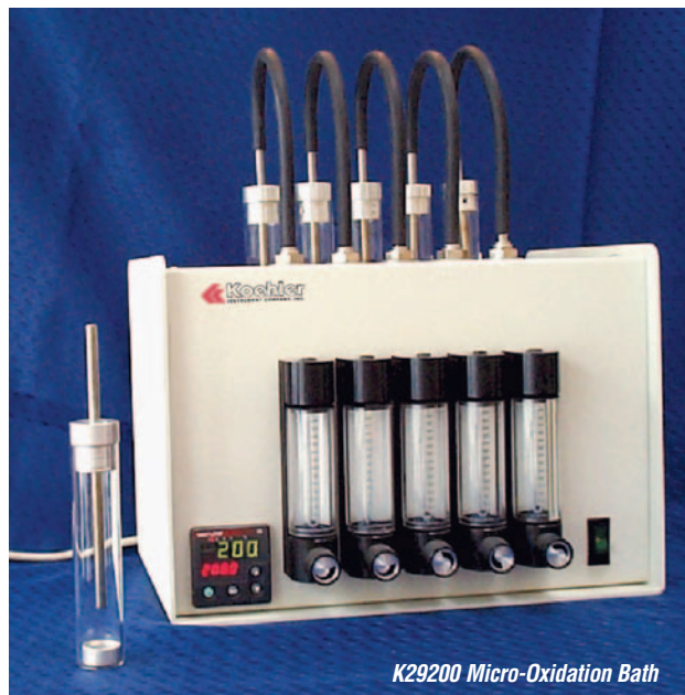
K29200 Micro-Oxidation Bath

Micro-oxidation system includes disposable steel specimen pans, Pyrex glass micro-reactors with aluminum headers and constant temperature aluminum block bath with flowmeters. Five-position bath maintains samples with \pm 0.1^\circ\text{C} accuracy in the range from 75°C to 300°C. Bath control has digital set and display of temperature and a high temperature alarm setting for safe operation. A built-in flowmeter with regulating valve for each sample cell maintains oxygen flow at the required rate of 20mL per minute.