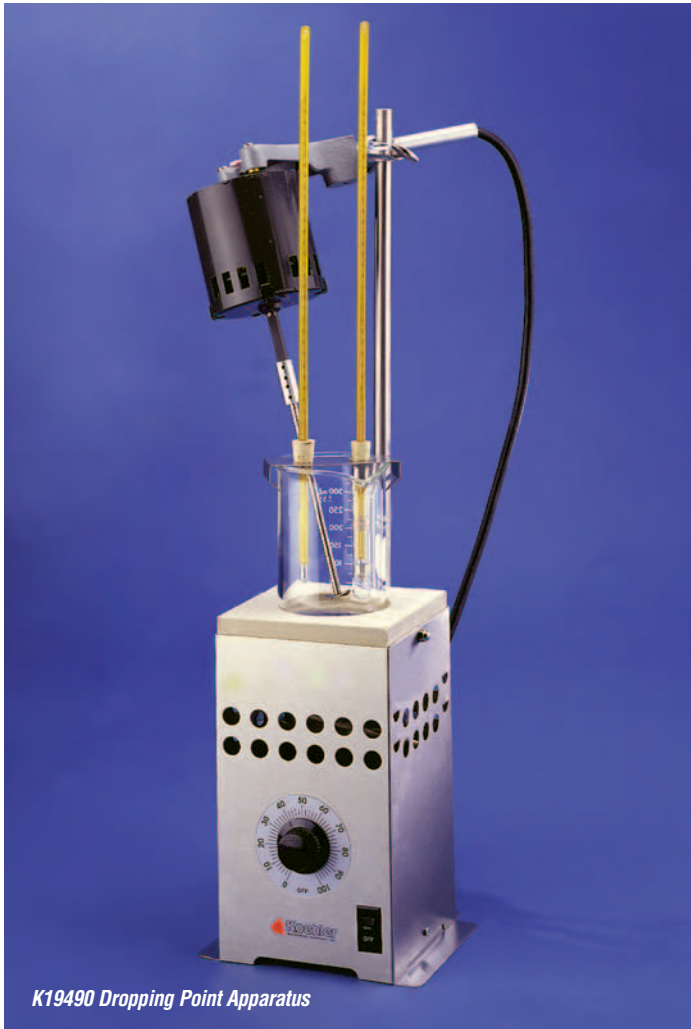
K19490 Dropping Point Apparatus