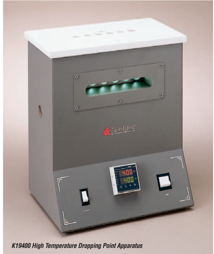
K19400 High Temperature Dropping Point Apparatus

Tests dropping points of lubricating greases at temperatures of up to 400°C (752°F). Includes thermostatically controlled aluminum block oven and six complete dropping point assemblies. Six-place oven has large viewing ports with fluorescent backlighting for excellent visibility. Microprocessor PID control provides quick temperature stabilization without overshoot and the bath is protected by an overtemperature control circuit that interrupts power should block temperature exceed a programmed cut-off point. Dual LED displays provide actual and setpoint temperature values in °C/°F format. Communications software (RS232, etc.), ramp-to-set and other enhanced features are available as extra cost options. Contact your Koehler representative for information. Microprocessor temperature control with digital readout and overtemperature safety cut-off maintains block temperature with ±0.5°C stability. Insulated cabinet has a chemical resistant polyurethane finish.