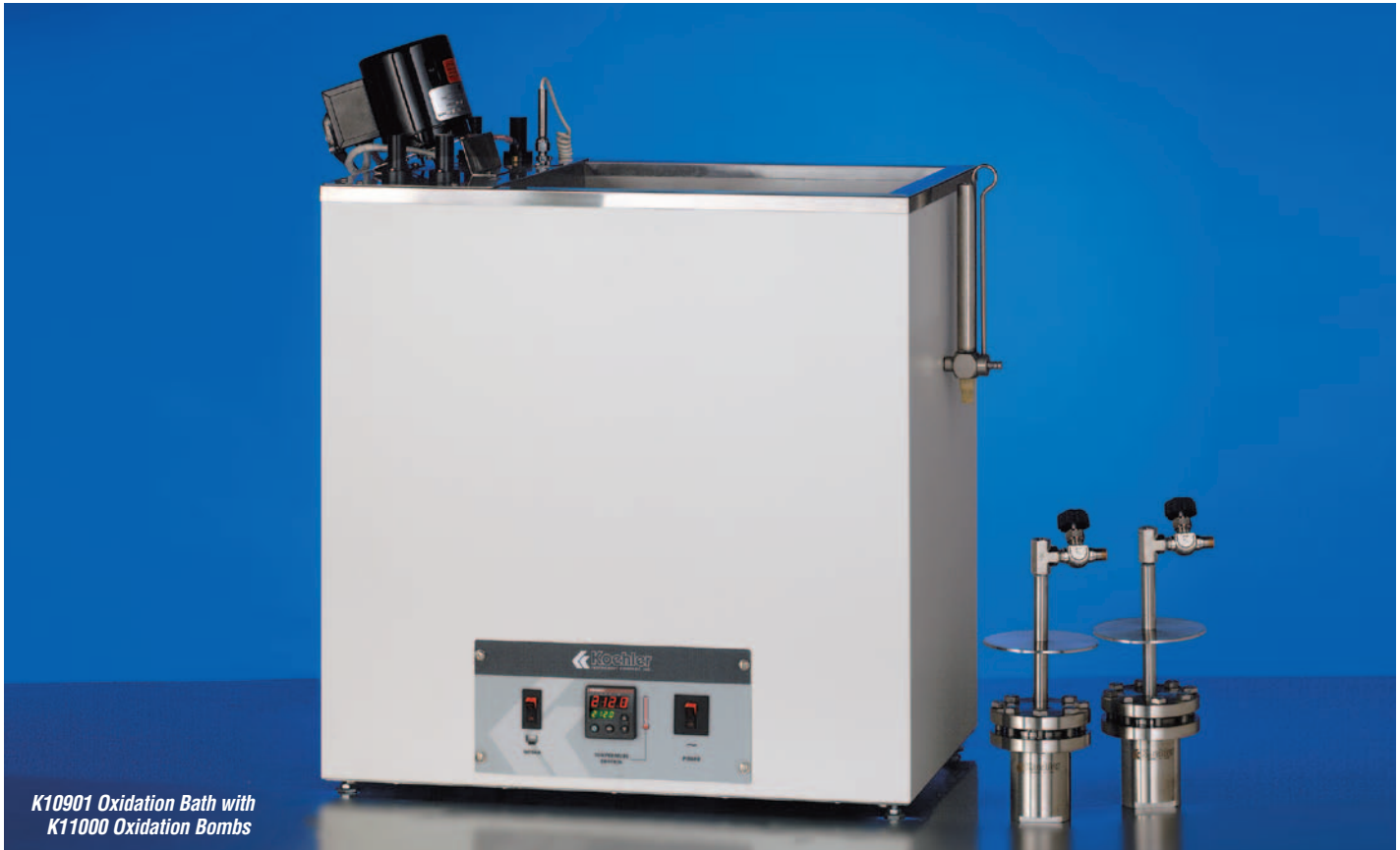
K10901 Oxidation Bath with K11000 Oxidation Bombs