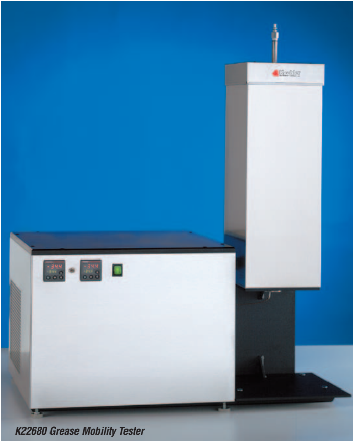
K22680 Grease Mobility Tester