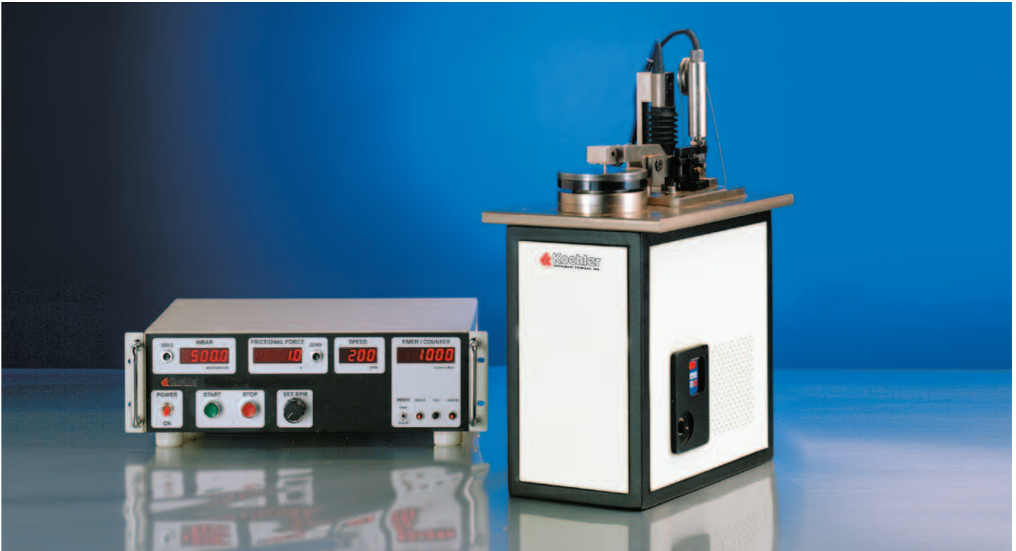
K93500 Pin-On-Disc Tester