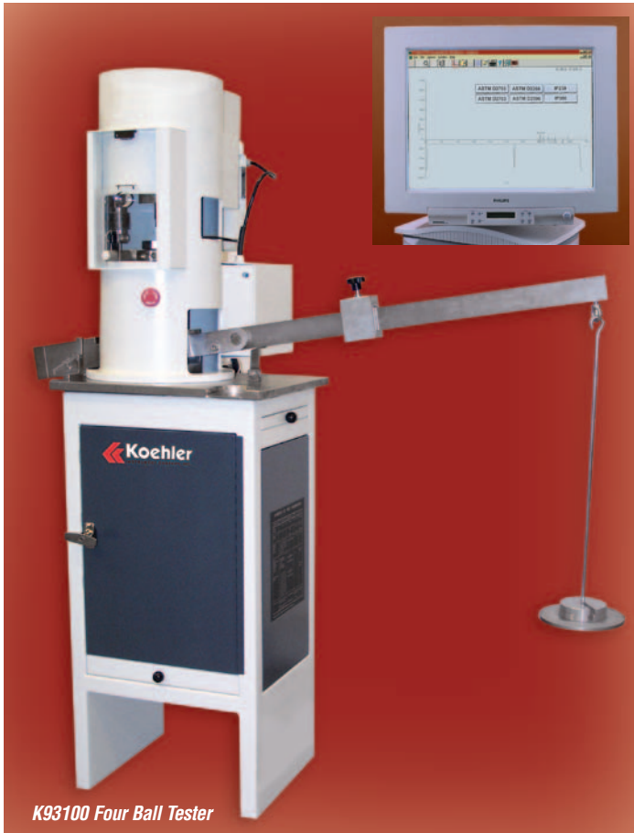
K93100 Four Ball Tester