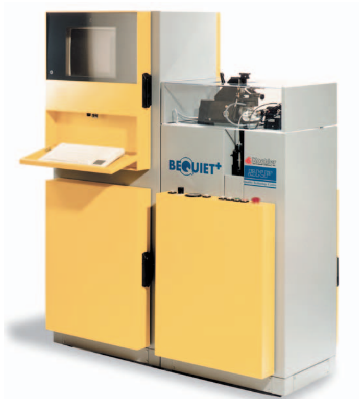
K94300 Grease Noise Tester

Dimensions l x w x h, in. (cm) 56½ x 25½ x 70 (141 x 65 x 170) Net Weight: 1870 lbs (850kg)