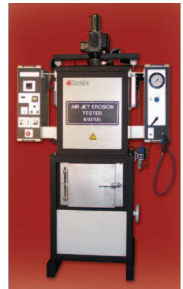
High Temperature Air Jet Erosion Tester