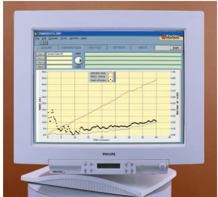
K93900 TriboDATA Data Acquisition System

Software on CD Acquisition Data Card Connection Cable Instruction Manual