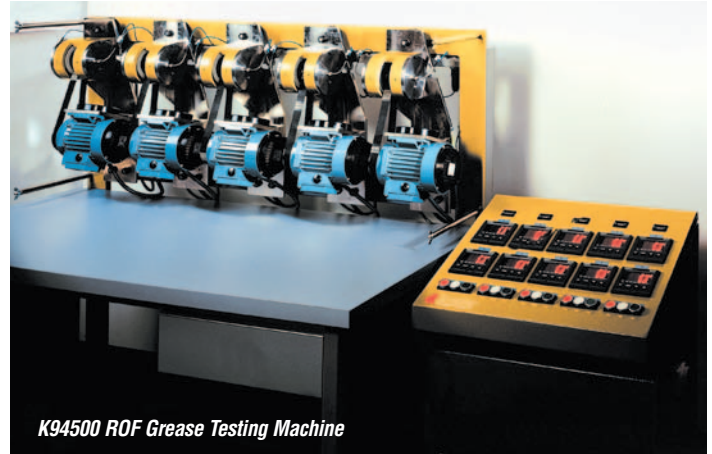
K94500 ROF Grease Testing Machine